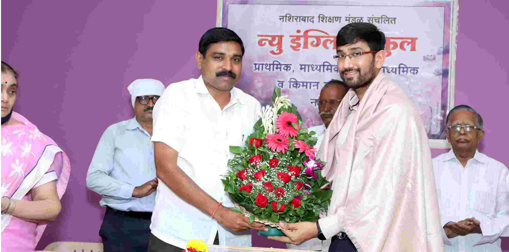
शालेय संच वाटप :