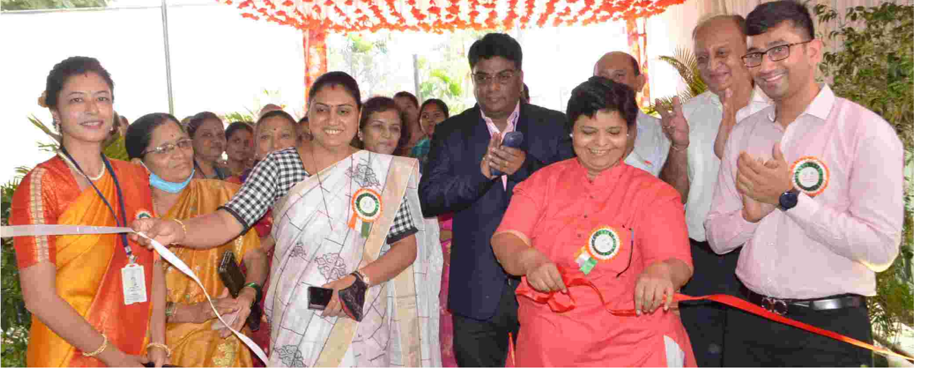
महिला बचत गट दिवाळी महोत्सव शुभारंभ :